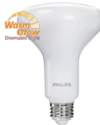
PHIL 475044 9BR30/LED/827-22/ DIM 120V (Replaces 65W)