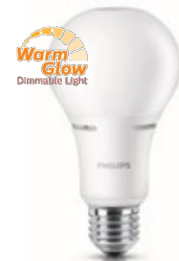
PHIL 479485 16A21/PER/827-22/ P/E26/WG 6/1FB (Replaces 100W)