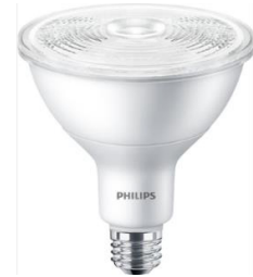
PHIL 471003 17PAR38/EXPERTCOLOR RETAIL/ F25/930/DIM/120V (Replaces 100W)