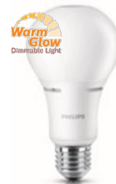
PHIL 479469 12A21/PER/827-22/ P/E26/WG 6/1FB (Replaces 75W)