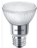
PHIL 471110 7PAR20/LED/F25/830/E26/ GL/DIM 120V (Replaces 75W)