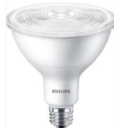
PHIL 471011 17PAR38/EXPERTCOLOR RETAIL/ F40/930/DIM/120V (Replaces 100W)