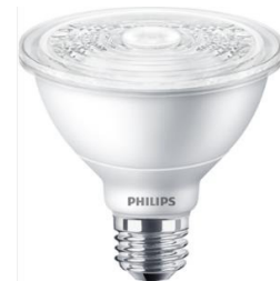
PHIL 470849 17PAR38/EXPERTCOLOR/F40/927/DIM/120 (Replaces 100W)