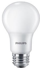
PHIL 554428 8.8A19/LED/927/P/E26/ND