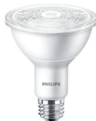
PHIL 471052 12PAR30L/EXPERTCOLOR RETAIL/ F40/930/DIM (Replaces 75W)