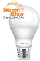
PHIL 479444 9.5A19/PER/827-22/ P/E26/WG 6/1FB (Replaces 60AW)