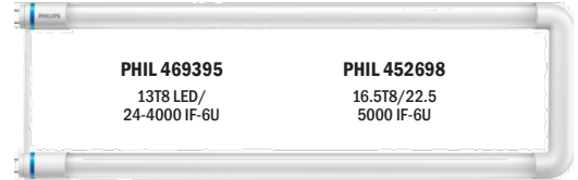
PHIL 469395 13T8 LED/ 24-4000 IF-6U