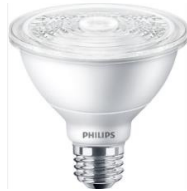
PHIL 471078 12PAR30S/EXPERTCOLOR RETAIL/F25/930/DIM/120V (Replaces 75W)